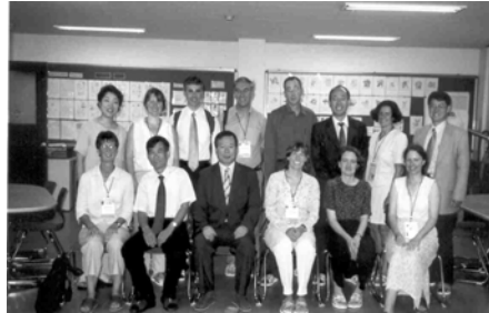
Conference delegates and school staff on the site visit.

Overall this was a very worthwhile conference covering a wide range of topics and providing the chance to gain some insight into Korean education, culture and life. The conference was well organised but tended to have too many simultaneous sessions (usually 18). Attendance at the conference proved to be an excellent opportunity to discuss issues about ergonomics in schools with other interested researchers from around the world both at conference sessions and at social events.