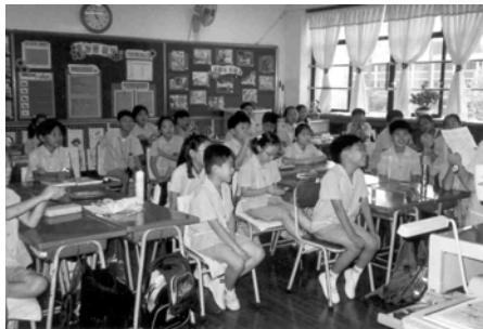
Children at Seoul National University School

A site visit was arranged to see Seoul National University Elementary School. On arrival we were introduced to the principal and some of his staff. It was a normal working day for the school therefore most of the staff were in the classrooms teaching at the time. We discussed the school with the principal with the help of an interpreter. We were served Ginseng tea and traditional biscuits. After tea, we were given a guided tour of the school where we were permitted to observe the normal workings of this Korean school.