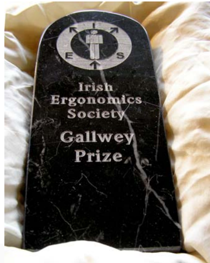
IES Award for Excellence